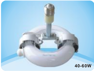
Dimensions [Unit: Inch(mm)]