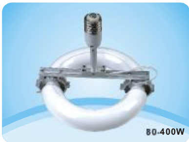
Dimensions [Unit: Inch(mm)]